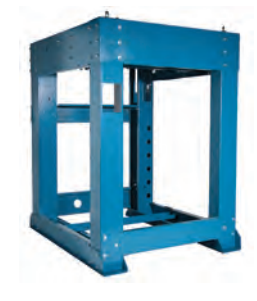
Milnor's suspended washer-extractor frames feature heavy-gauge steel columns for maximum durability.