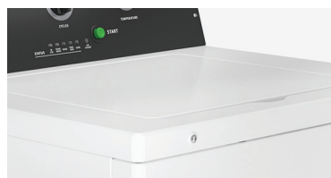
PREMIUM PORCELAIN ENAMEL TOP & LID