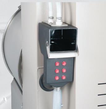
30022 V8Z chemical inlet shown

Chemicals are injected in the rear of the machine (unlike certain brands where chemicals are injected near the front of the machine at eyelevel). Chemicals are diluted and flushed into the sump of the washer-extractor so that raw chemical does not come in direct contact with the linen or the stainless steel.