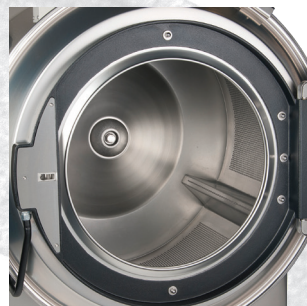
36026 cylinder shown

Milnor's tall rib construction and precise cylinder speeds combine to provide excellent MAF – Mechanical Action Factor – delivering excellent wash quality and reducing time-consuming and costly rewashes.