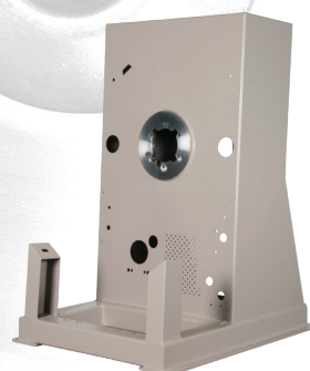
30022 V8Z frame shown

Milnor frames are designed to prevent concentration of stress in one spot and all structural components are tied together for optimum stress dispersion. This proven structural integrity means your machines will last longer.